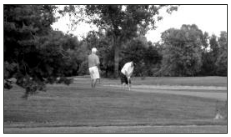
"I sure hope I can hit the green form here."