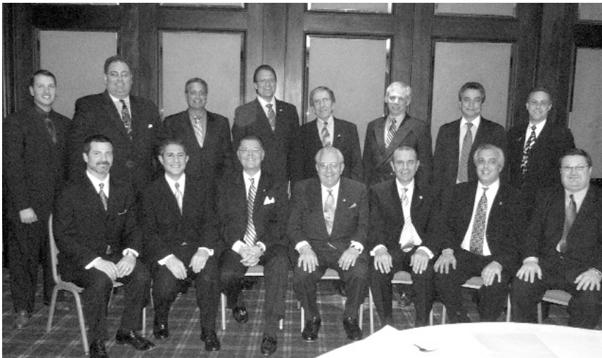
2007 IACC Board Officers and Directors