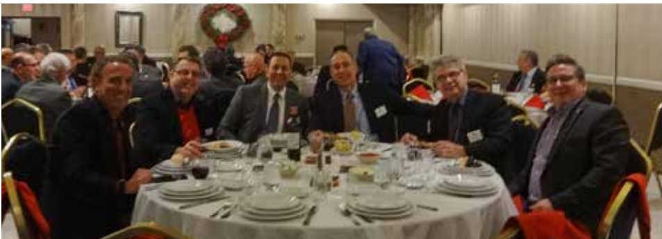
This group looks hungry. Fern Hill never disappoints!