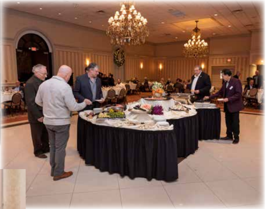
Members enjoying the delicious appetizers