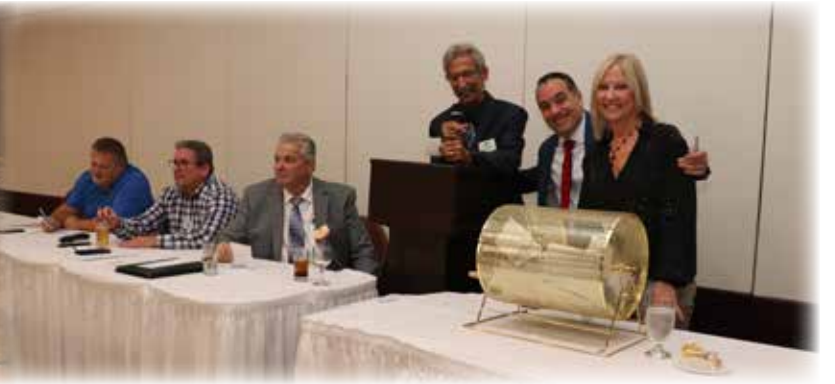
The Festa Della Lira committee ready to give away some cash!