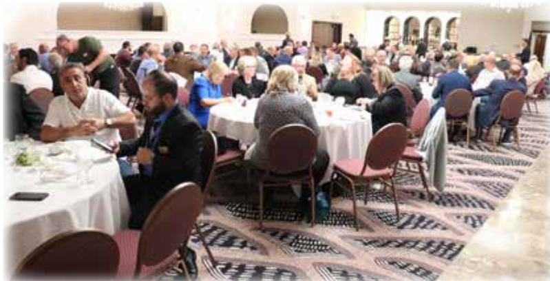
A packed house tonight!