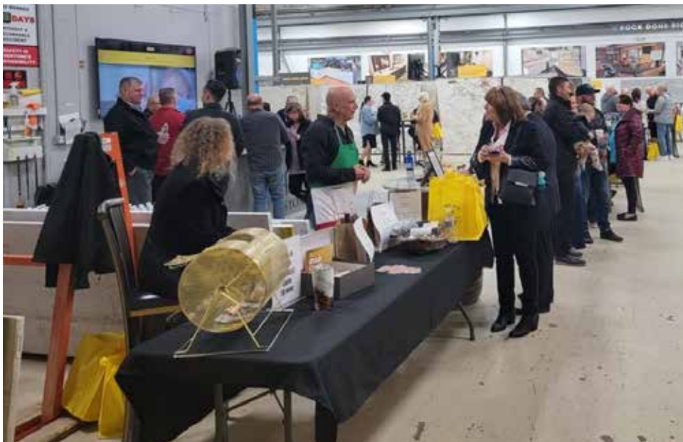
"Get your raffle tickets for some nice prizes!"