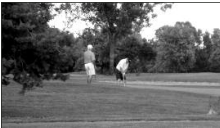
"I sure hope I can hit the green from here."