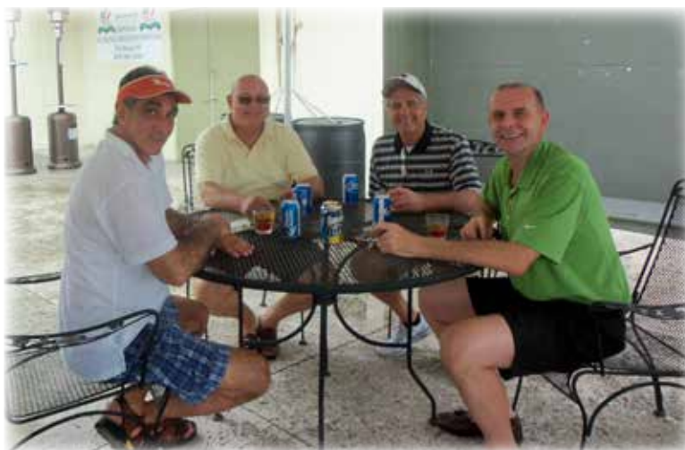
Cocktail hour between a few "buds"