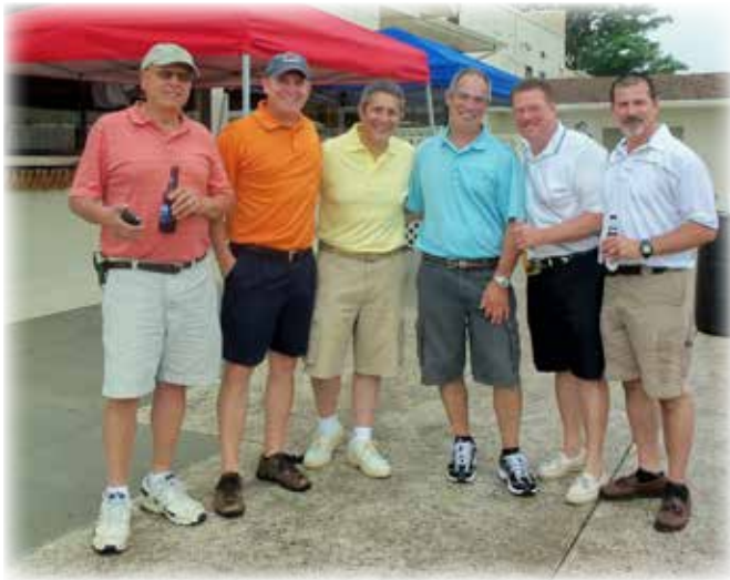
Golfers enjoying the cocktail hour