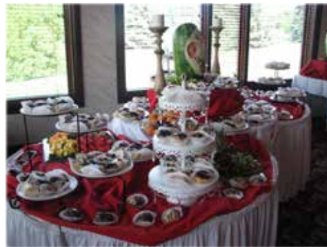
Beautiful pastry table presented by Il Fornaio Bakery