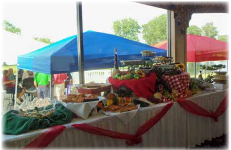
Delicious appetizers served during cocktail hour!