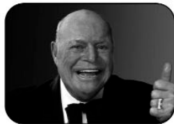
April 11 & 12 Don Rickles