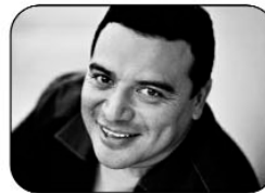
April 19 Carlos Mencia