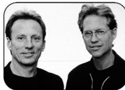
April 18 America