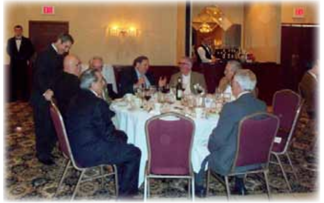
Members enjoying a great meal!