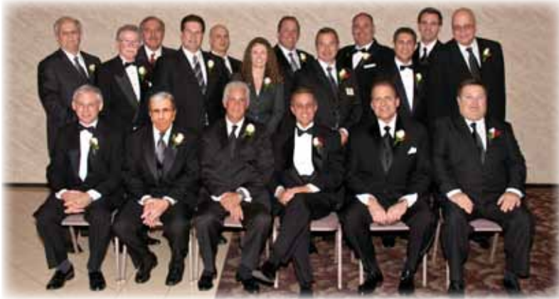
2012 Officers/Board of Directors