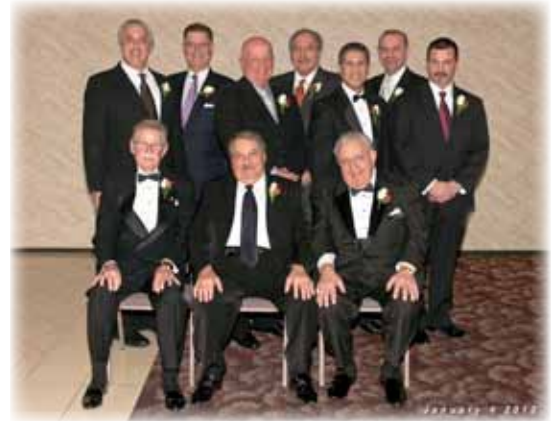
2012 Past Presidents Council