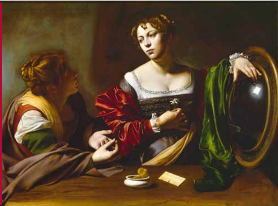
The Conversion of the Magdalen, Michelangelo da Merisi, called Caravaggio, ca. 1598, oil and tempera on canvas. Detroit Institute of Arts