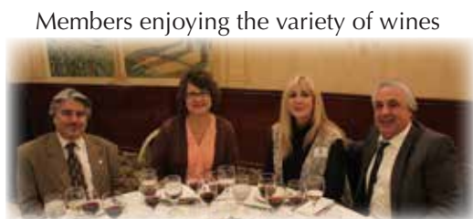
Members enjoying the variety of wines