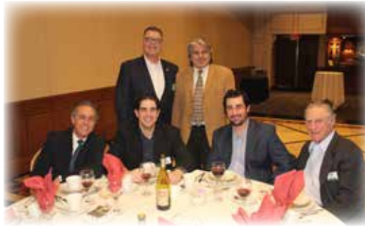
Big smiles all around! Lets eat!