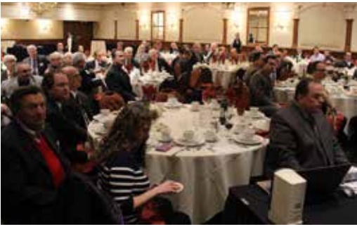
A packed house enjoying the presentation!