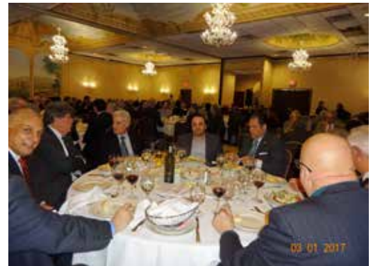
A full house!