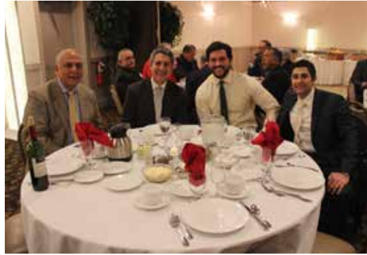
Members anxiously awaiting dinner