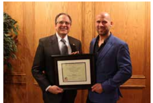
Michael Peraino of Killer Creations Photography & Cinematography