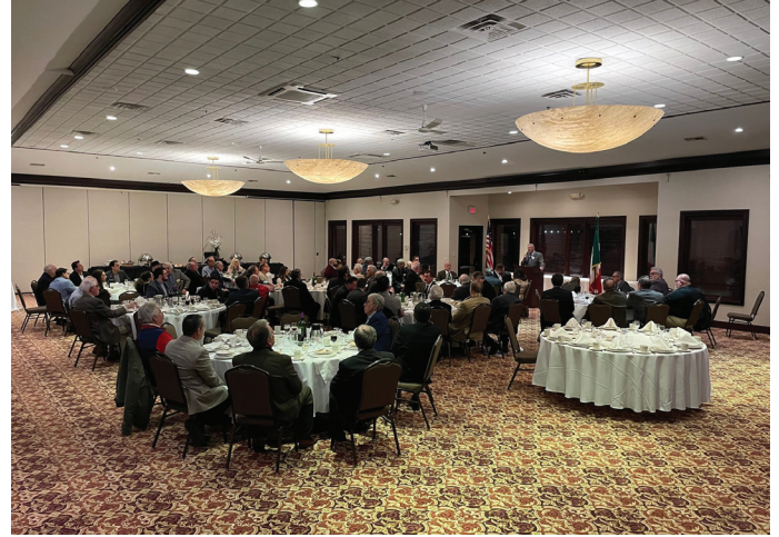
Nice turnout and excellent food at the Italian American Cultural Center