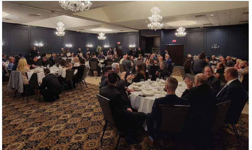
Everyone loves coming to Andiamo Italia Warren, always a full house!