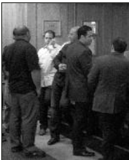
Guests enjoying cocktail hour