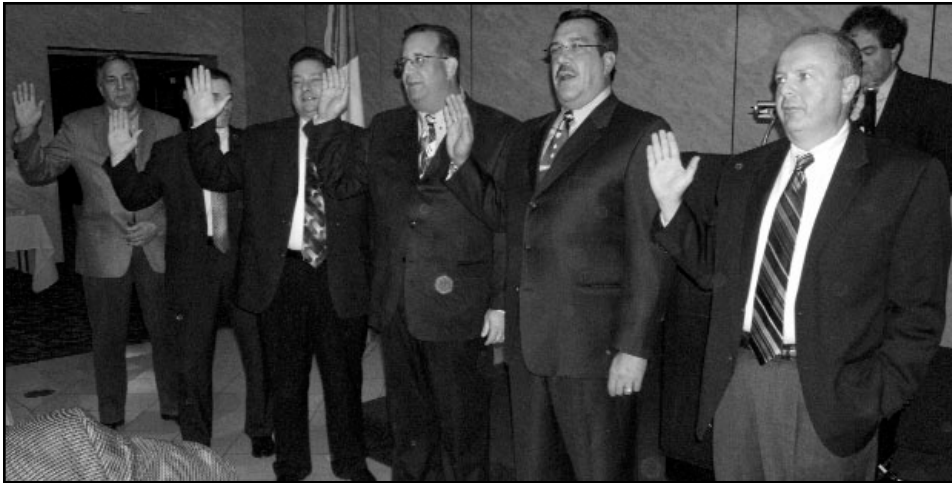
New members being sworn-in