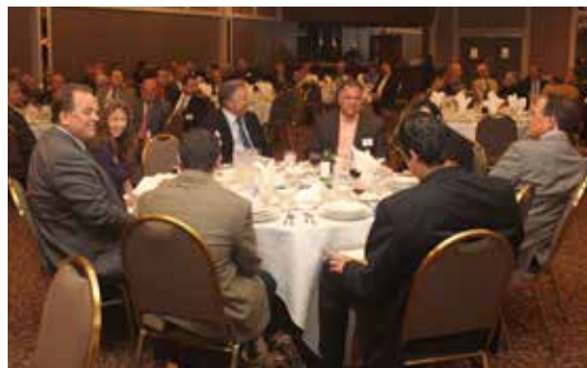
A packed house anxiously awaiting the fine food from the Zuccaro family!