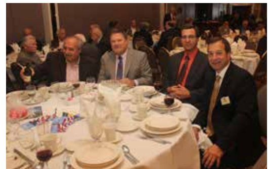
Members enjoying some wine and camaraderie before dinner!