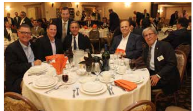
Smiling faces all around....lets eat!