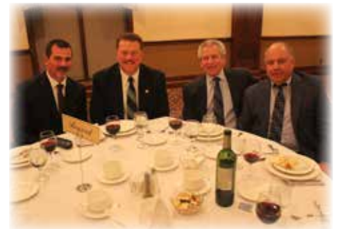
Members enjoying the delicious appetizers