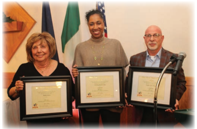
Welcome to the Italian American Chamber of Commerce