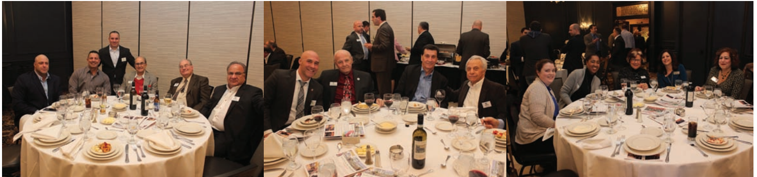
Members & Friends! "Always great food at Andiamo"