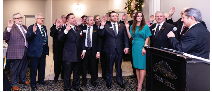
The official swearing in of the 2022 Officers & Board of Directors