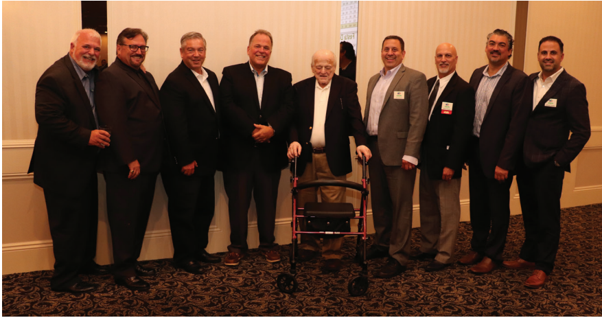
The Happy Winners!