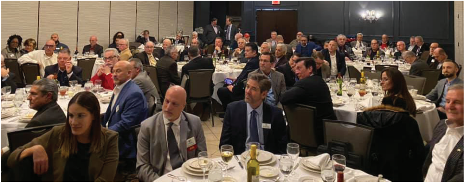
A full house at Andiamo!