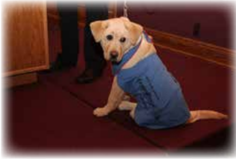
Proceeds from the Festa Della Lira basket of cheer go to benefit "ruff" and the Leader Dogs for the Blind!