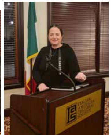
Paola Allegra Baistrocchi, Consul of Italy in Detroit