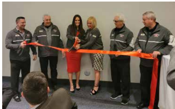
Thrilla at the Villa committee members cutting the ribbon on the new "Thrilla Gives" non-profit