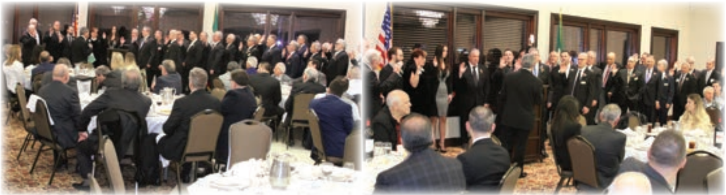
The swearing-in of the 2024 Officers & Board of Directors