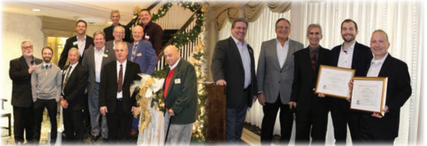
After the board meeting, several Officers and Board of Directors pause for a quick photo.